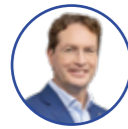
Ola Källenius Chief Executive Officer, Mercedes-Benz Group

09:00 One on One Chat on transformation at Mercedes-Benz Group